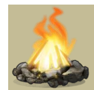
Recreational Fire with Barricade Ring