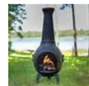
Closed Style Manufactured